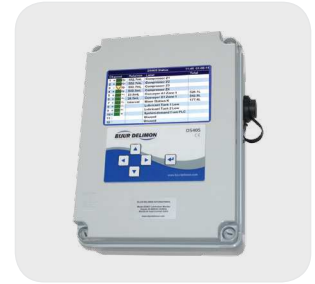
DS405 Lubrication Monitor