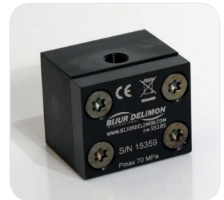
Lube Point Monitor (Part #55105)